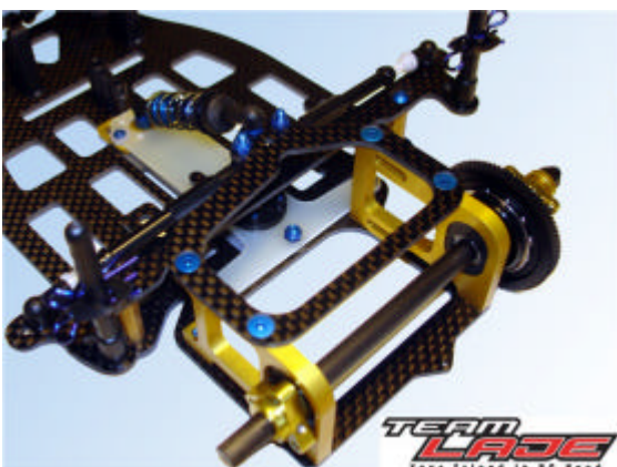
Team Lajes SpeedEvil2007 rear end design with graphite rear axle and precisions spur gear