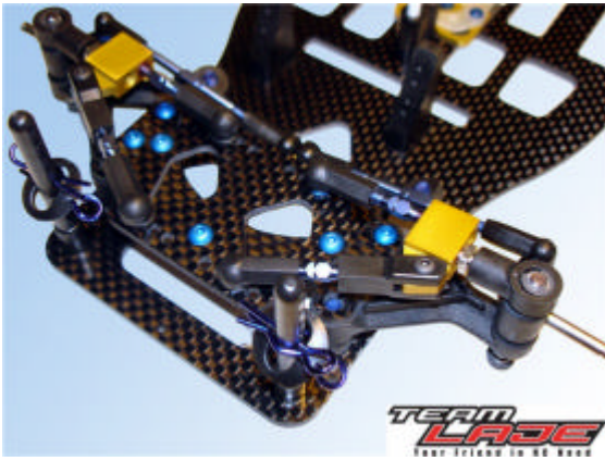
Team Laje's MH front end is the most adjustable on the market.

SpeedEvil has since it's debut 2004 won Swedish, Nordic and the French championships. Now even better. Take a closer look on the SpeedEvil2007 and become a winner with Team Laje.